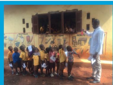
Children waiting for their eye test